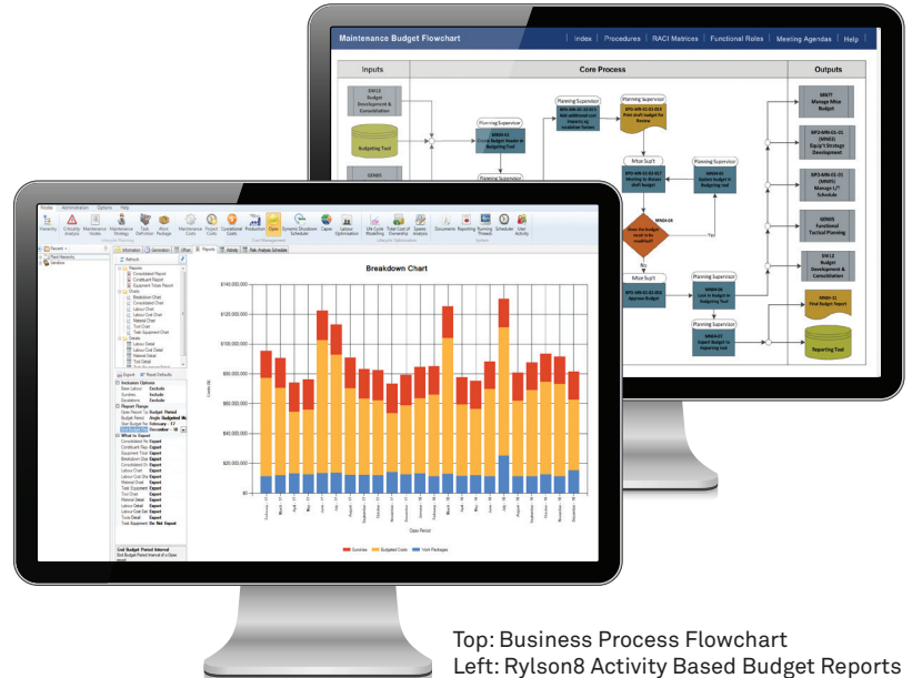
Top: Business Process Flowchart Left: Rylson8 Activity Based Budget Reports